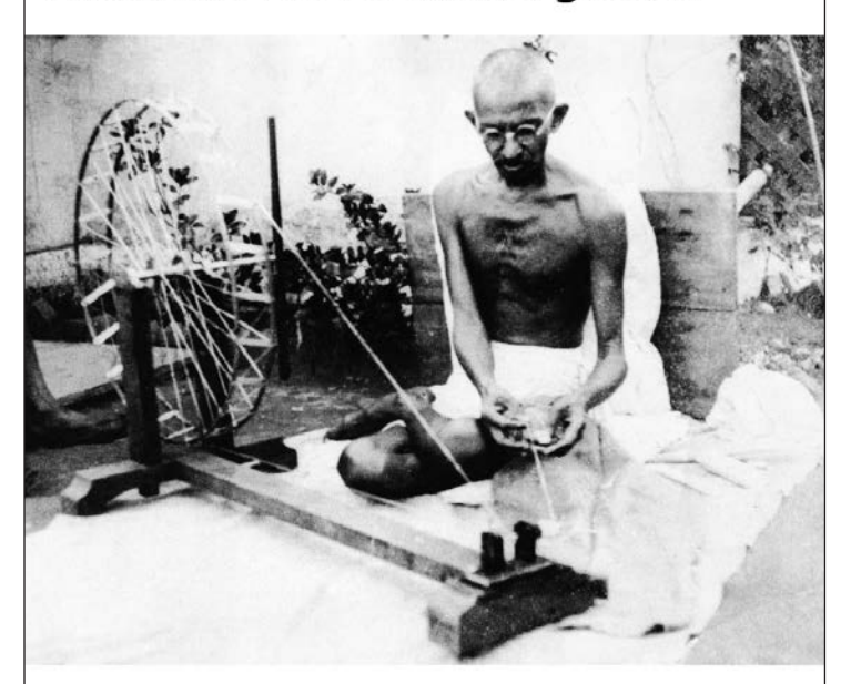
99 Tactics of Successful Tax Resistance Campaigns

Look for it on Amazon or at your local bookseller starting in January 2014.