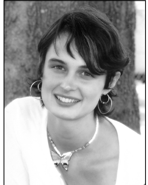
Julia Butterfly Hill

For a little bit it was a roller coaster, and now it's really solid. I started out cautious. I was not so much concerned for my own comfort as others might be. I believe our addiction to comfort has held a lot of people back from being liberated in this country. I think that's why we see powerful movements in other countries where people don't have as much access to privilege. They don't have that addiction to creature comforts, so they are willing to take more risks, which ends up being very liberating for them.