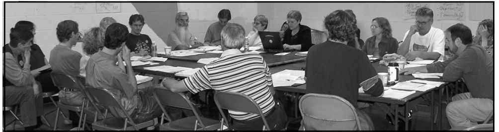
Coordinating Committee meeting, Brooklyn New York, October 9, 2005.

*These members complete their terms in May 2006. ▼