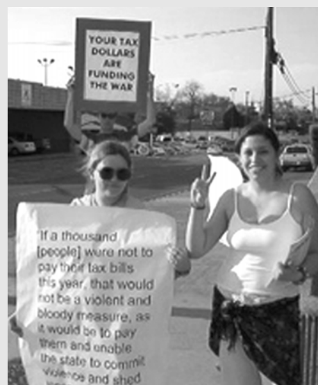
Tax day is Coming! April 15 is a Saturday this year, and the last day to file is Monday, April 17, so there's lots of opportunity for demonstrations this year. Pictured: Tax Day 2005 in Denton, Texas.